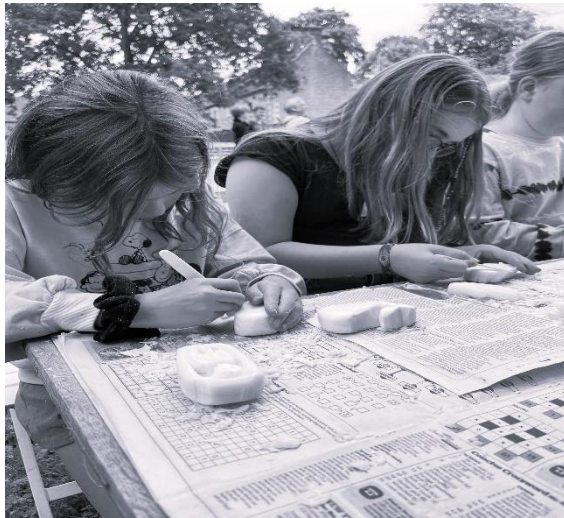
Young visitors trying their hand at soap carving At the Lost in Wood Day at the Courtyard

It would be appreciated if all contributors could get their items to me by Wednesday 13 th November for the next edition ( e-mail sudburysketch@btinternet.com )